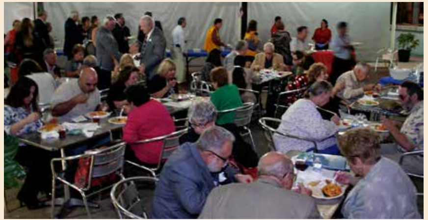
Lions and guests end the evening with a festive paella dinner at the Bascom Palmer Eye Institute patio.