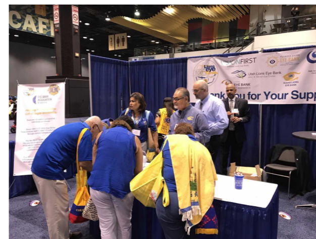
Left: Lions eye banks' booth at the convention, with eye bank staff from across the United States.

In cooperation with six other Lions eye banks, Florida Lions Eye Bank hosted an informational booth at the convention. Visitors to the booth were invited to learn about corneal transplantation and donation, and take a quiz to receive a commemorative pin. The participating eye banks were Idaho Lions Eye Bank, Utah Lions Eye Bank, Vision First: Indiana Eye Bank, Lions Eye Bank at Albany, Lions Eye Bank of Delaware Valley, and Nebraska Lions Eye Bank. These seven participating eye banks, which represent only a fraction of all Lions eye banks, restore sight to thousands of people annually!