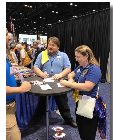
Right: Visitors to the booth take a quiz to test their knowledge of corneal donation and transplantation.